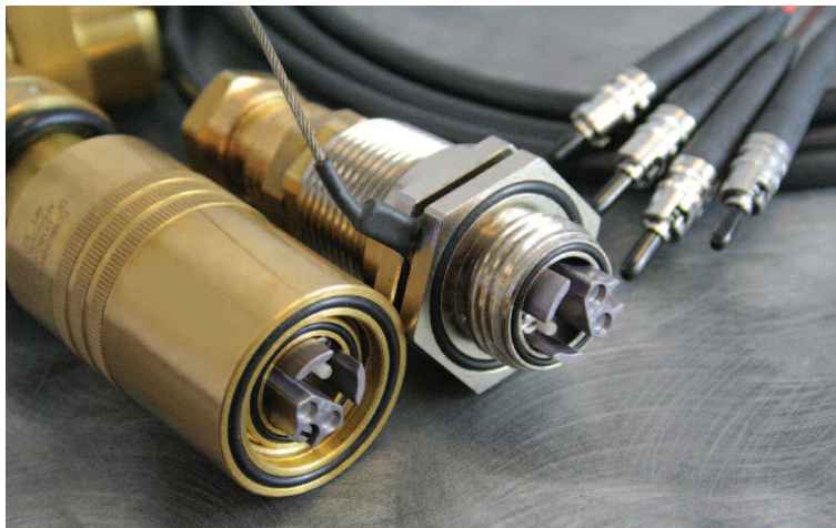
TFOCA-II® EX Plug & Receptacle